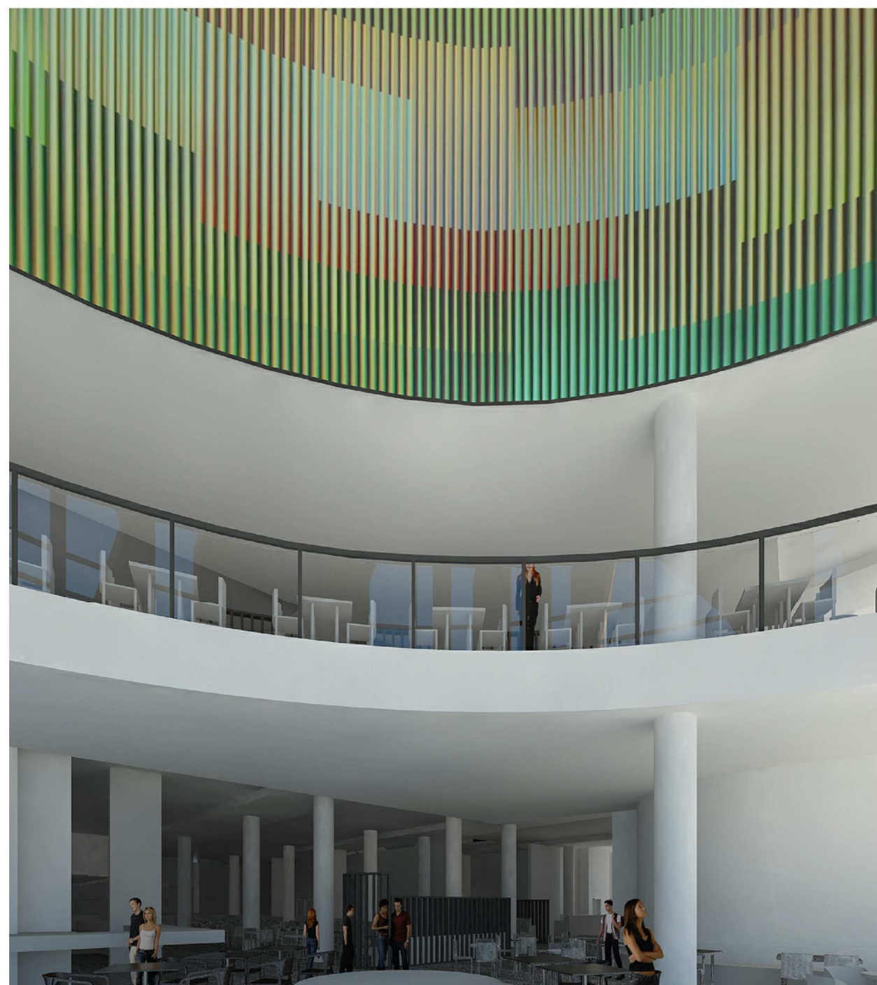
3 - INTERIOR PERSPECTIVE - VIEW 3 Scale: 1:100